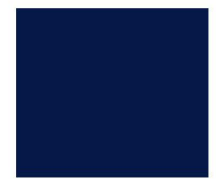
NAVY + NAVY (FR/AR)